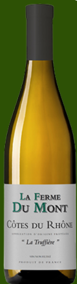
Le Ferme du Mont Cotes du Rhone Blanc "La Truffiere" Rhône Valley, France $348 $238