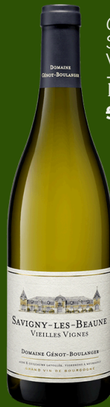
Genot Boulanger Savigny Les Beaune Blanc Vieilles Vignes 2021 Burgundy, France $7188 $588