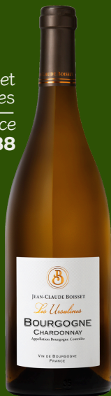
Jean Claude Boisset Bourgogne Chardonnay Les Ursulines Burgundy, France $418 $288