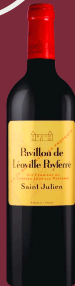
Pavillon Leoville Poyferre 2015 Bordeaux, France $878 $588

For further details, please contact Lobby Lounge at 2989 9075 or Dining Room at 2989 9017. Pictures are for reference only. F&B Certificate is not applicable to the above wine promotion. All offer is subject to availability while stock last.