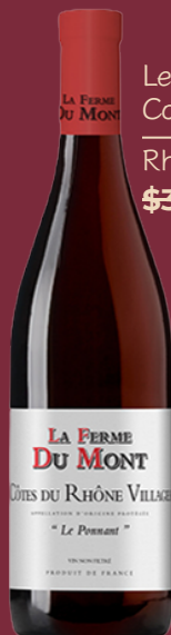
Le Ferme du Mont Cotes du Rhone Villages Rouge "Le Ponnant" Rhône Valley, France $358 $248