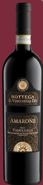
Bottega Amarone della Valpolicella DOCG Veneto, Italy $638 $428