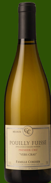
Cordier, Pouilly Fuisse 1er Cru, Vers Cras 2023 Burgundy, France JM92 $7128 $688

Order your favourite wines and get an extra 10% discount on the purchase of any 6 bottles of wine.