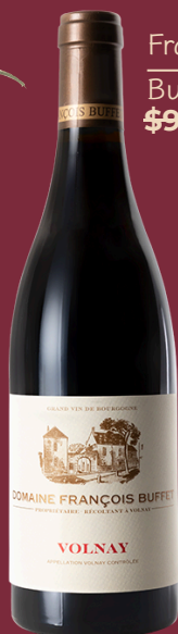
Francois Buffet, Volnay 2022 Burgundy, France VN(90-92) $998 $498